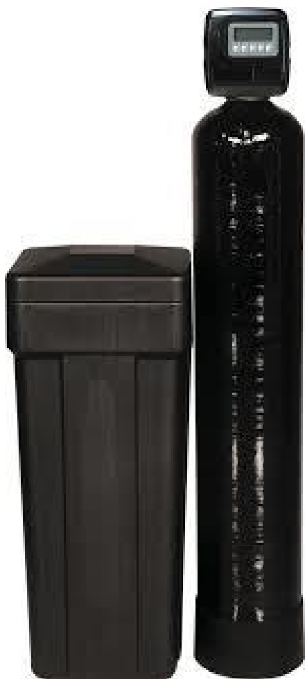
2 Tank Models